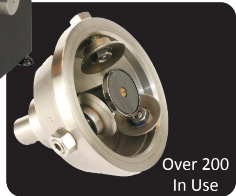
Seam Stripper Head